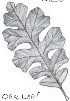
Oak Leaf $500