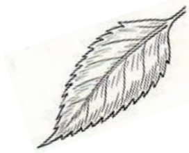
Alder Leaf $250

The path that leads into Montessori Country School's Community Building provides a wonderful opportunity to recognize the generous donors who have helped make the MCS expansion a reality. Honor your family or loved one with a leaf-shaped insert. Each metal leaf will have donor information permanently etched into it for a lasting impression. Order forms due June 30th, 2017*